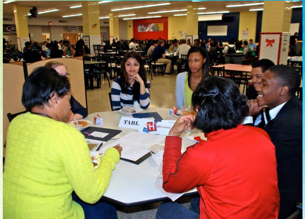
Students and professionals discuss workplace preparation at a Career Day breakfast.