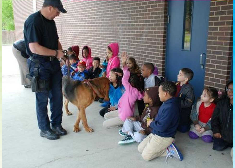
The NN Police K-9 unit visits a school during Career Day.