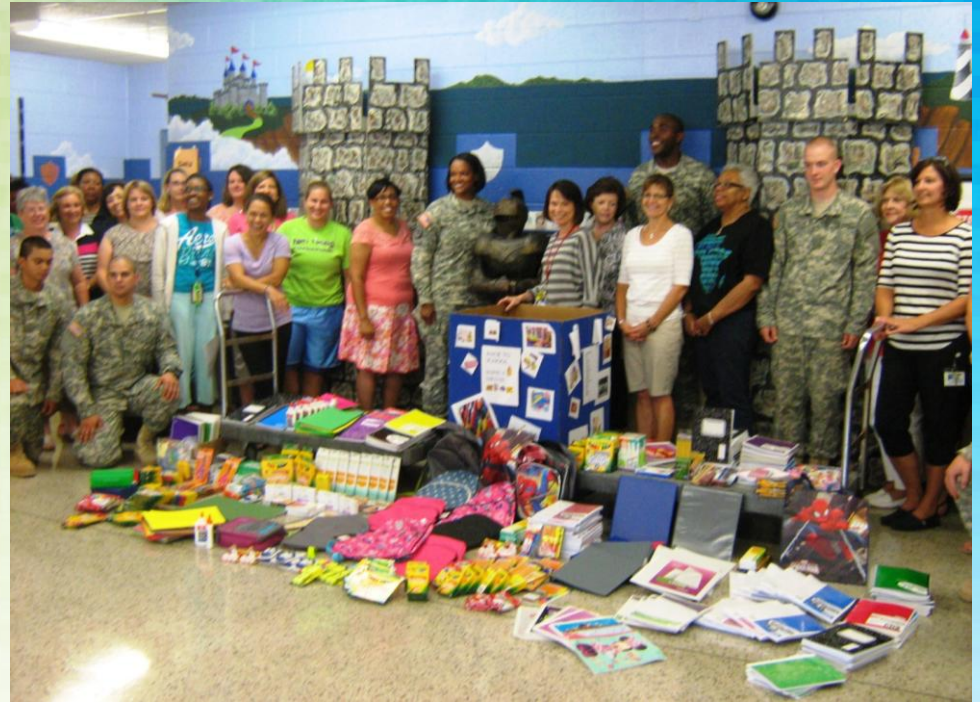
Solders from Fort Eustis collected school supplies for students at R.O. Nelson Elementary School.