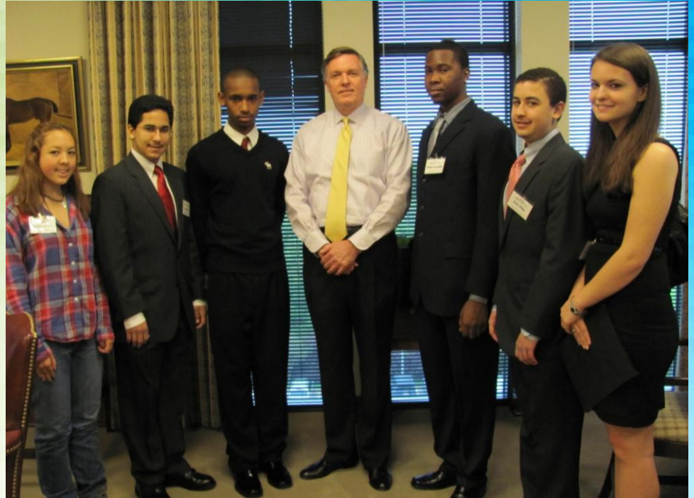
Ferguson Enterprises hosts students for one-day mini internship during Spring Break.