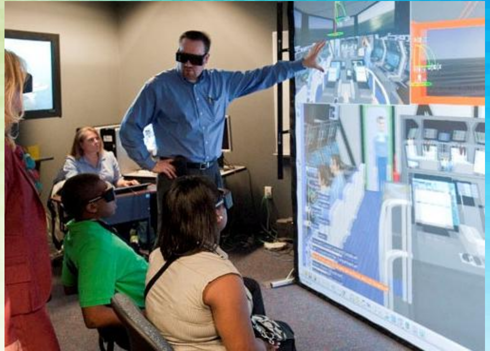
Students explore high-tech design careers at Newport News Shipbuilding.