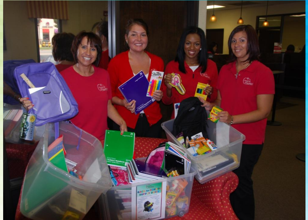
Virginia Educators Credit Union collects school supplies for students.